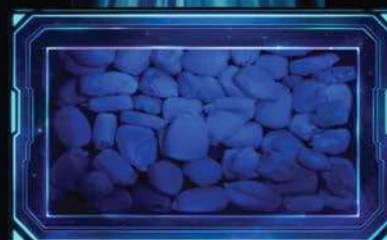
UV LIGHT IMAGE